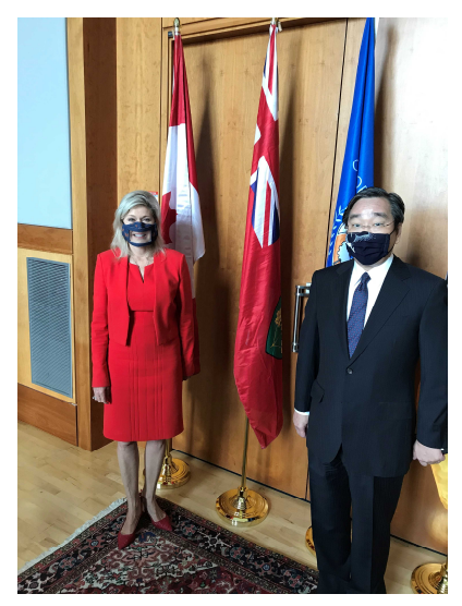
Her Worship Bonnie Crombie, Mayor of Mississauga

I was also able to meet the following dignitaries: