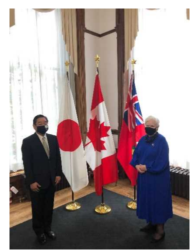
The Hon. Elizabeth Dowdeswell, Lieutenant Governor of Ontario (Oct. 27)