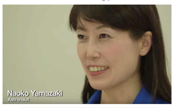
To Make Women Shine: WAW! From Japan to the World https://www.youtube.com/watch?v=J fe1zioiOY&feature=youtu.be